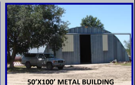
50'X100' METAL BUILDING