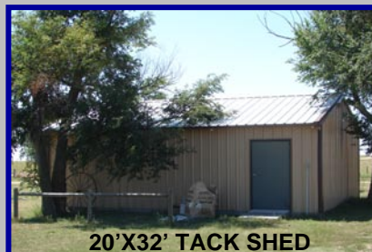
20'X32' TACK SHED