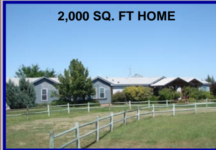
2,000 SQ. FT HOME

IMPROVEMENTS: '96 2,000 sq. ft. modular home w/4 bedrooms (master plus 3) on main floor & fireplace in living room, 1 bedroom, office & playroom downstairs; oversized 2-car garage, covered patio and underground sprinklers. The property is well landscaped. There is also a 1,250 sq. ft. remodeled 1 bedroom second home-- perfect for a hunting retreat or guest cottage. This tract includes a 50'x100' Curvette w/14' doors, 110v and 220v electrical; a new 20'x32' tack shed w/oversized walk-in door; and 13,350 bushels of grain storage.