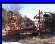
30' KRAUSE CHISEL