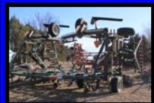
FK 7X6 BLADE PLOW