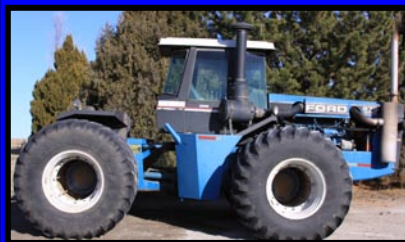
FORD 976 TRACTOR