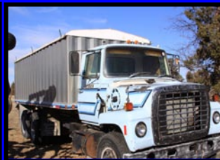
'78 FORD W/22'X60" B&H