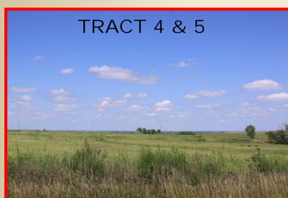
TRACT 4 & 5

AGENCY: Farm & Ranch Realty, Inc., its agents and representatives, are the Exclusive Agents of the Seller.