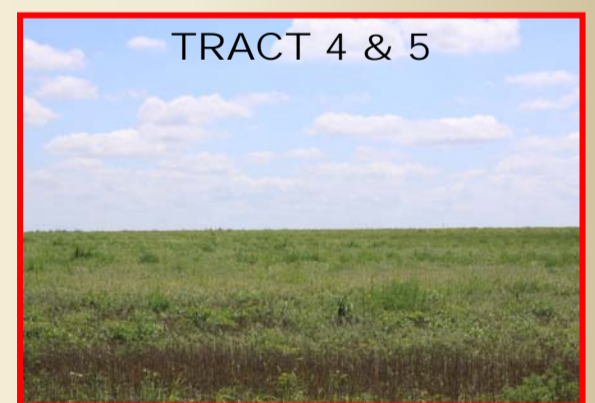
TRACT 4 & 5

ACREAGES: Acreage figures are considered to be approximate and are from reliable sources, based on (USDA) FSA figures. All FSA information is subject to change. FSA acres may not be the same as deeded acres.