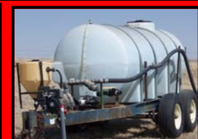
1,000 GAL NURSE TRAILER