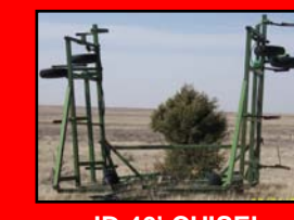
JD 40' CHISEL