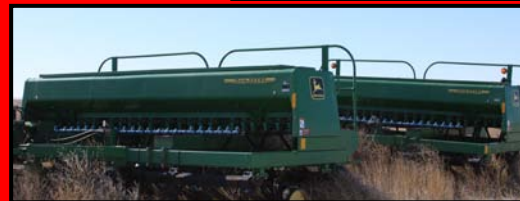
JD 750 30' NO-TILL DRILL