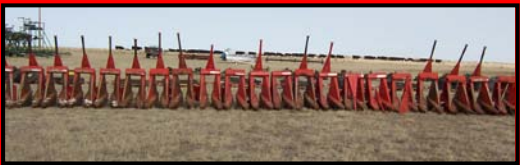
28) HESSTON HEAD HUNTERS