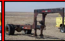
HM 5 TH WHEEL GN TRAILER