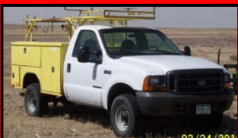
'00 FORD F350