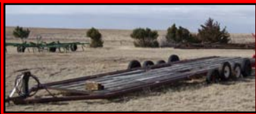
36' DONAHUE TRAILER