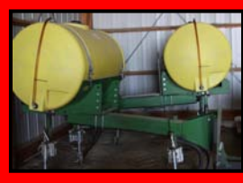
2) JD SIDE MOUNT TANKS