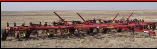
SF 9X6 BLADE PLOW