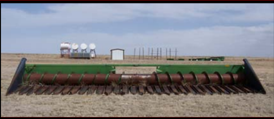
JD 230 GRAIN HEAD