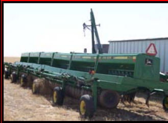
JD 9400 60' HOE DRILLS