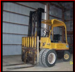
HYSTER CHALLENGER 50

TERMS: Cash or good check day of sale. No items to be removed before being settled for. Announcements made day of sale take precedence over printed material.