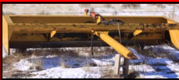
10' BOX SCRAPER