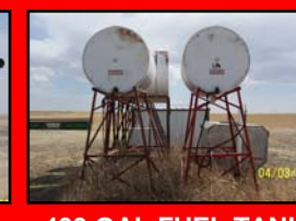
400 GAL FUEL TANKS