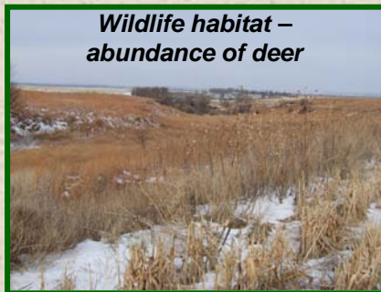
Wildlife habitat – abundance of deer