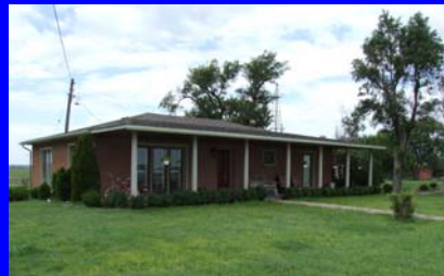
4 BEDROOM BRICK