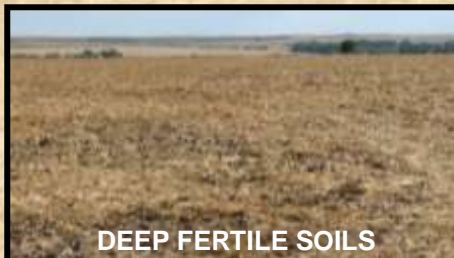
DEEP FERTILE SOILS

Other amenities include the Cedar Bluffs Reservoir and over 200,000 acres of walk-in hunting nearby.